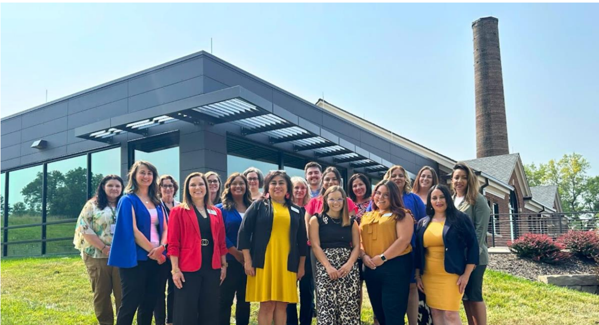
IKC Board members and IKC staff present at the Annual Meeting.